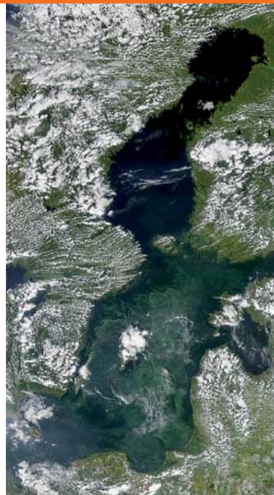
Algal bloom of Nodularia spumigena covering much of the southern Baltic Sea