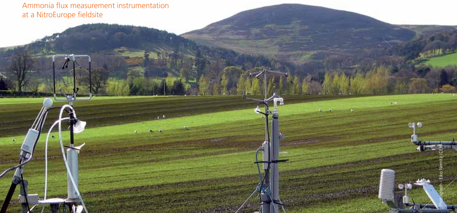
Ammonia flux measurement instrumentation at a NitroEurope fieldsite